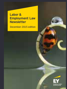
December 2015: Dispute resolution