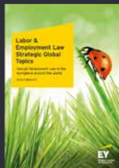
2018 Edition #1: Sexual Harassment Law in the workplace around the world