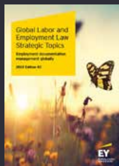
2019 Edition #2: Employment documentation management globally