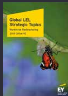
2018 Edition #2: Global LEL Strategic Topics Workforce Restructuring