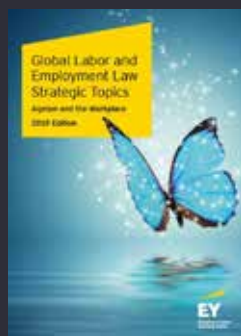
2019 Edition: Ageism and the Workplace