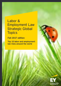
Fall 2017: Top 10 labor and employment law risks around the world