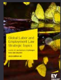
2020 Edition #2: COVID-19: Workplace Challenges Now and Beyond