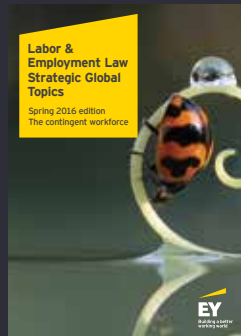
Spring 2016: The contingent workforce