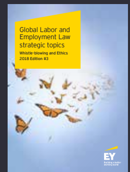
2018 Edition #3: Global LEL Strategic Topics Whistle-blowing and Ethics