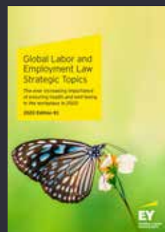
2020 Edition #1: The ever increasing importance of ensuring health and well-being in the workplace in 2020