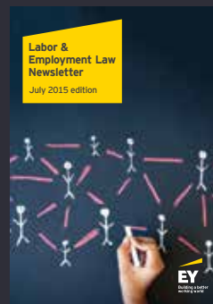
July 2015: Restrictive covenants