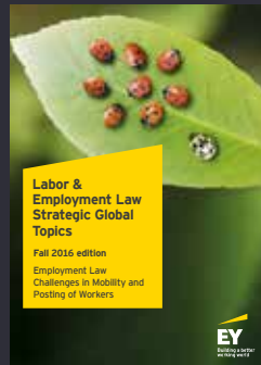
Fall 2016 : employment law challenges in mobility and posting of workers